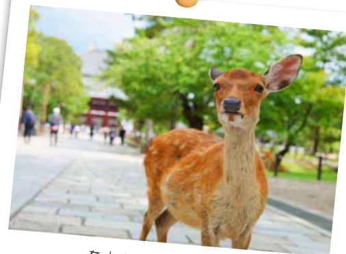
奈良公园 / Nara Park