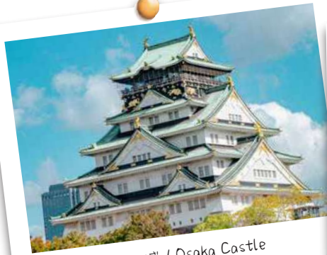
大阪城 / Osaka Castle