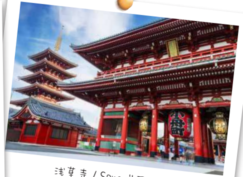
浅草寺 / Sensoji Temple