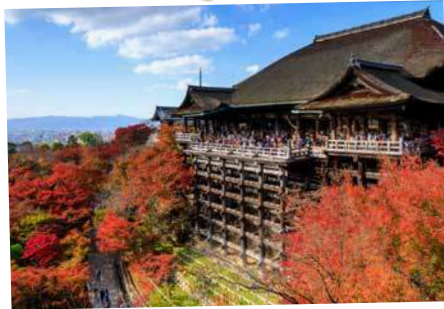
清水寺 / Kiyomizu-dera Temple